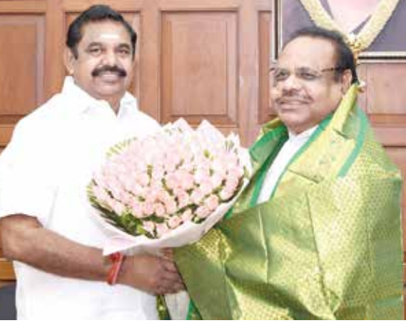
Chief Minsiter Edappadi Palaniswami called on Speaker P.Dhanapal before tabling the demand for grant for the department of Police, Fire rescue for discussion in the Assembly.